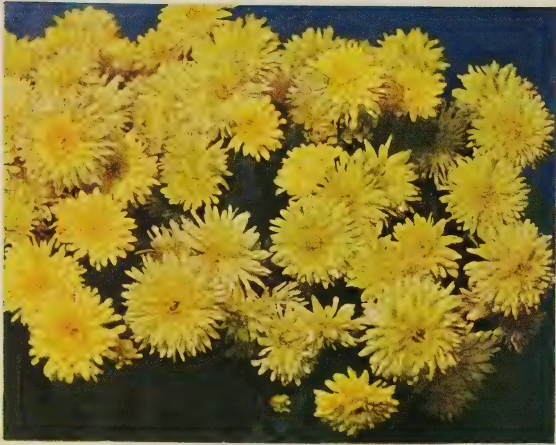
YELLOW AVALANCHE. 50c each; 3 for $1.25